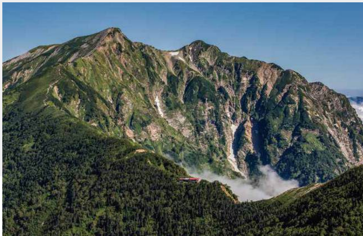
Mt.Kashimayarigatake seen from Mt.Jiigatake