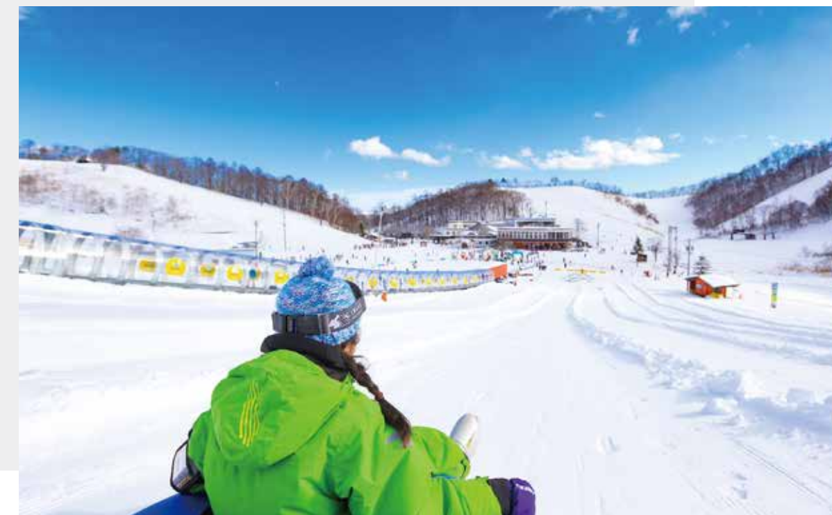
Kashimayari Ski Resort